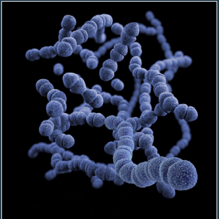
A microscopic image of Streptococcus - a Disease of Public Health Significance.