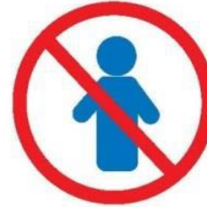
* Class B Public Pools (no lifeguards) Children under 12 admitted only with parent or guardian