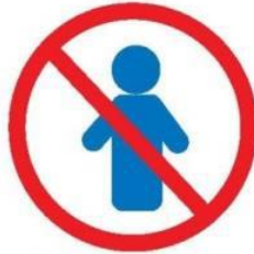
Children under 6 admitted only with parent or guardian