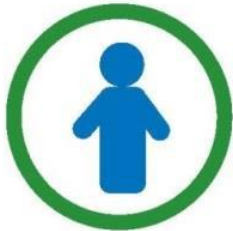
Tested swimmers permitted to enter alone